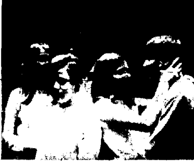
Present Albee play