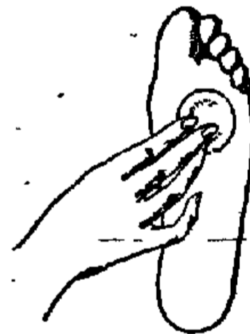
Wonderful for callouses or tender spots on sole

Take the coupon below to the corner drug store or to the nearest department or shoe store. You'll get in return a sample of Dr. Scholl's Zino-pads. Put it on. In one minute you'd never know you had a corn. The pain is gone.